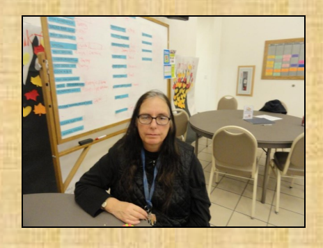
"The State Fair was great and I enjoyed myself fully."