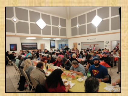
Everyone really enjoyed the Clubhouse Thanksgiving Dinner! We served over 100 people and it was delicious!