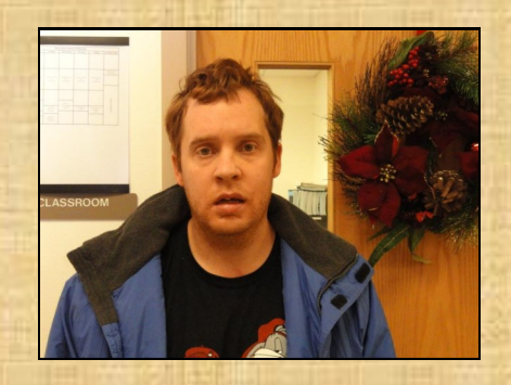
"I like the different groups and classes offered here at Clubhouse."