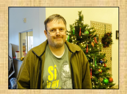
"Going to Layton for the UCN conference. I enjoyed meeting new friends."