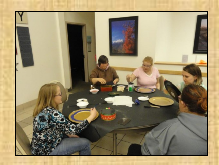
The girls are all working together to make Christmas Countdown platters.