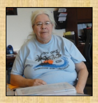
"Thanksgiving dinner was great and the Halloween dance was fun too."