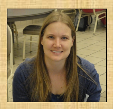
"The Wasatch Wellness Run because I ran and walked the one mile with my mom and daughter."