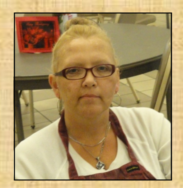
"My favorite activity at Clubhouse was going to the UT State Fair."